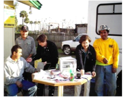
Health Education Program test blood pressure, glucose and provides information about health needs at Farmworkers Association in Pierson

The past has set us on a good course. In December 2010 we formed a relationship with Greater Horizons and the Greater Kansas City Community Foundation. We contract with them to manage and invest our endowment funds. Donors can now check their funds online 24/7 and make grant recommendations. Greater Horizons has a variety of other services that we may use in the future. A billion dollar community foundation, they provide back office services to smaller community foundations across the country.