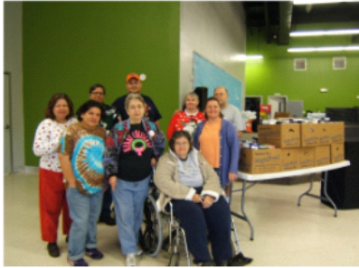
Pine Ridge Fellowship Methodist Church Volunteers for their Angel Food Ministry received a grant